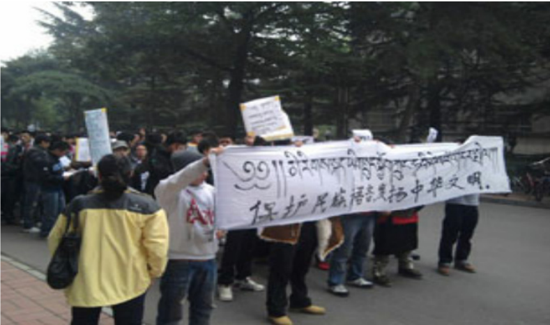
Students at the Beijing National Minorities University protest the Mandarin language education policy (22 October 2010)

argument is to “speed up modernization,” which is hindered by the promotion of less developed languages. Support for this argument depends on “the fact that participation in higher education and success in many different types of jobs demand fluency in Chinese, and therefore many parents belonging to ethnic minorities (especially those with an education themselves or with positions as cadres) naturally prefer their children to get an education first of all in the national language”. 127 Therefore, the PRC has formulated a widespread belief that Han people are superior, more capable of learning, and deserving of good jobs and therefore for minority people including Tibetans to escape from poverty (which the PRC is purposely perpetuating) they must assimilate with Han culture and learn Mandarin Chinese.