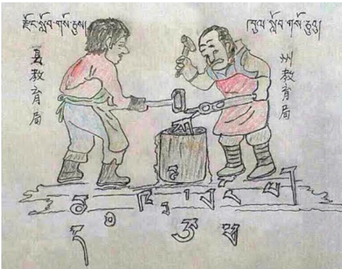
An illustration shows the destruction of Tibetan language by the County and Prefecture level education departments (2014)

was essential to succeed in obtaining a more permanent attractive job outside agriculture”. 54 It was also observed, “Formal Chinese state education was brought forward as one attractive option for eventually securing a job and income for children.” 55 In effect, young Tibetans do not see the value in learning and speaking Tibetan language if it will not “fill their stomachs”. 56 By excluding Tibetan from the administrative spheres and giving Chinese a predominant position in government including the ability to make education policy decisions, and “by offering only a handful of professional openings based on a command of Tibetan,” the PRC has formulated the idea that Tibetan is a worthless language. 57