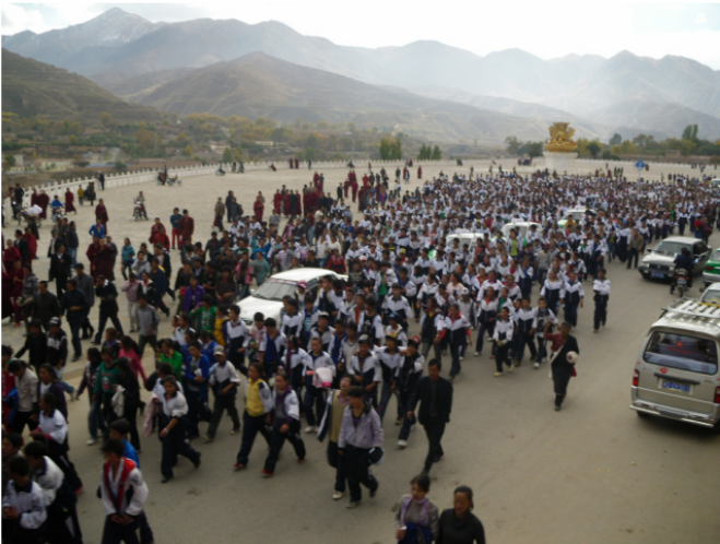
Tibetan school children protest in Rebkong (October 2010)

2000-2010: Conflicts between Tibetans and the PRC continued through the 2000s, culminating in the October 2010 protest against language policies. Numerous protests were documented by TCHRD in various areas in Tibet. The 2008 uprising was one of the longest running series of protests across the entire Tibetan plateau and the largest Tibetan uprising since 1959. 185 The most striking element of the protests across Tibet was their spontaneous nature, and the manner in which they completely defied a repressive regime supported by heavy military forces.