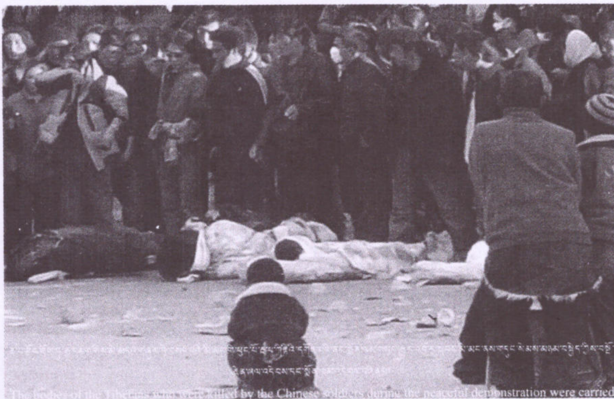
The bodies of the Tibetans who were killed by the Chinese soldiers during the peaceful demonstration were carried