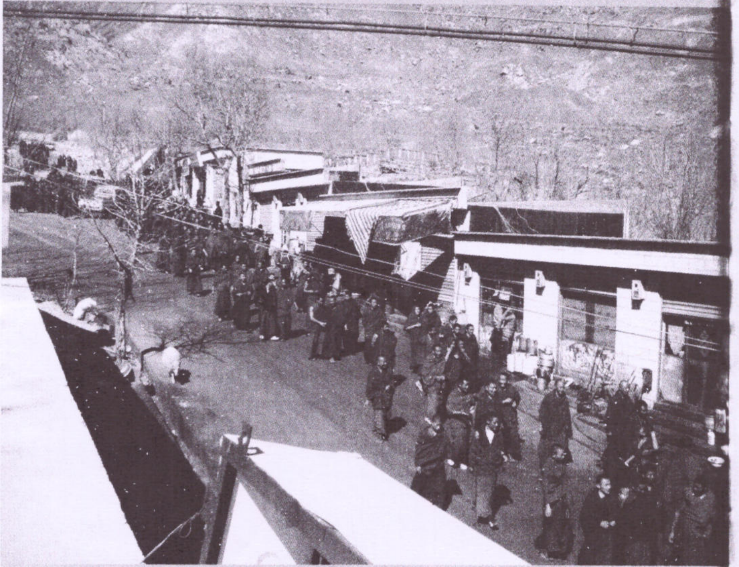
Hundreds of protesting Drepung monks on a peaceful march towards the Barkhor Street, Lhasa on 10 March 2008